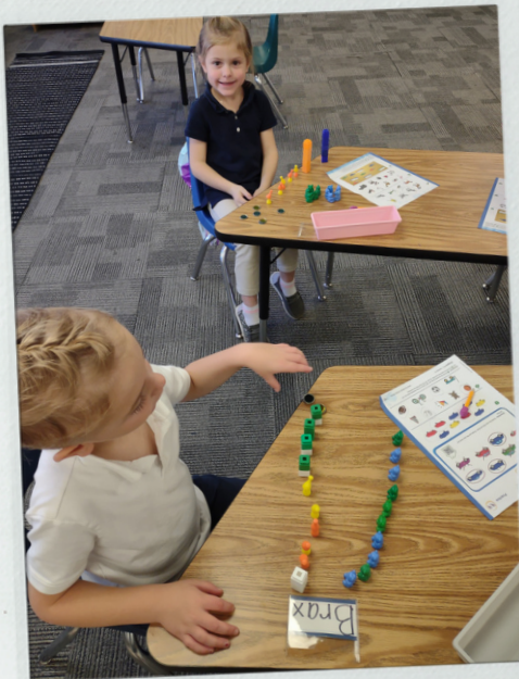
Classifying categories of math manipulatives!